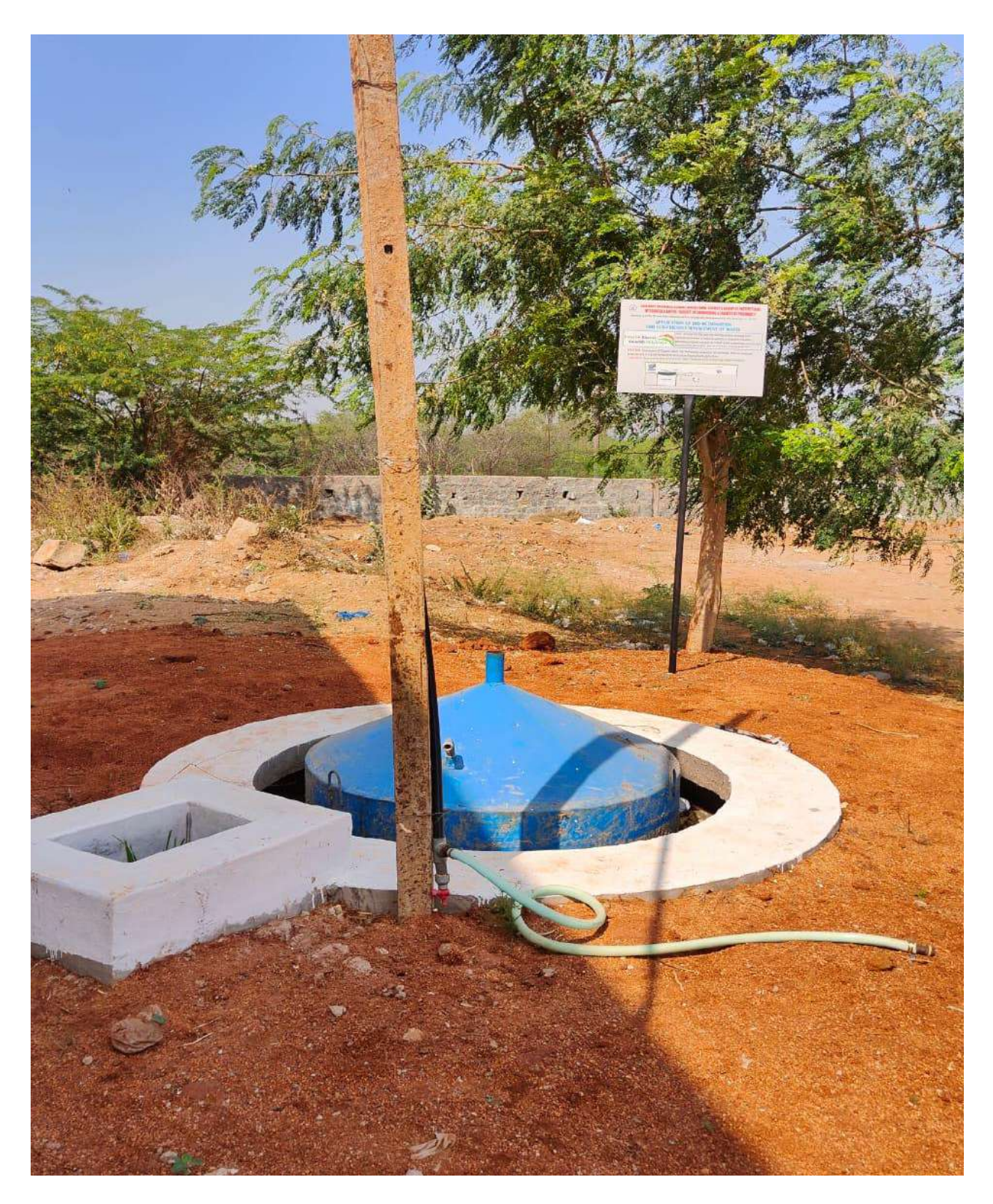
Bio-Gas Facility at Campus Premises